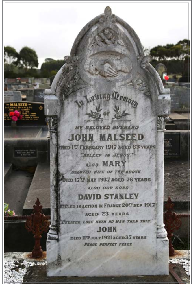
Malseed Family Grave, Condah, Victoria