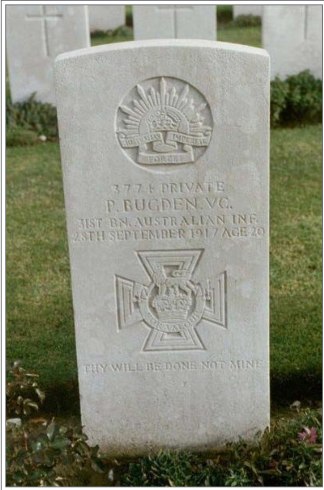
Australian Victoria Cross recipient